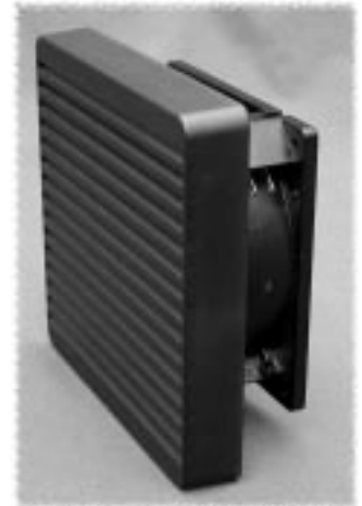
Assembled (fan not included)